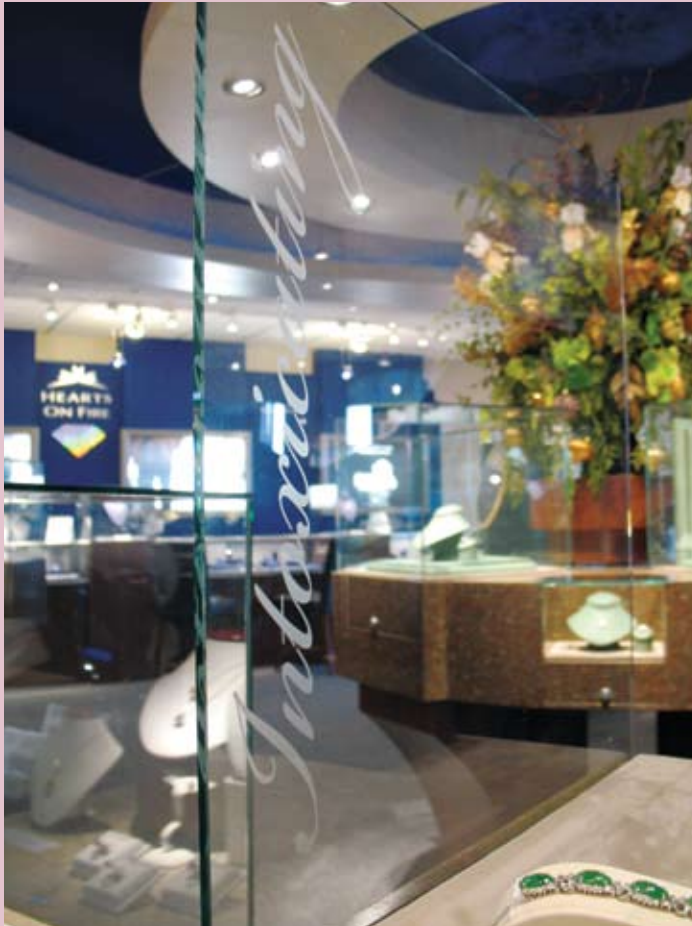
Glass display cases at Lyle Husar Designs are etched with evocative words like intoxicating .

even include instructions on how to present gifts to recipients. "I have salespeople repeat relevant stories to their customers as an example of how something special was given by others," Husar says.