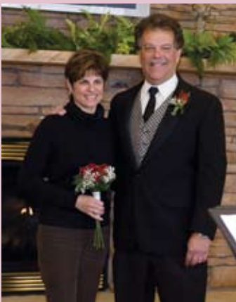
Couples from all walks of life take advantage of Ben David Jewelers' in-store wedding ceremonies held each Valentine's Day.